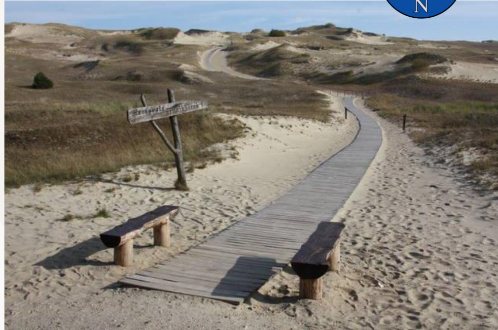
Sand dune in Nagli Nature reserve with burried villages, Curonian Spit, Lithuania