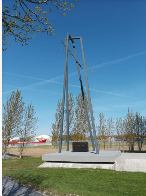
Memorial of the victims of ferry Estonia disaster, Pärnu, Estonia