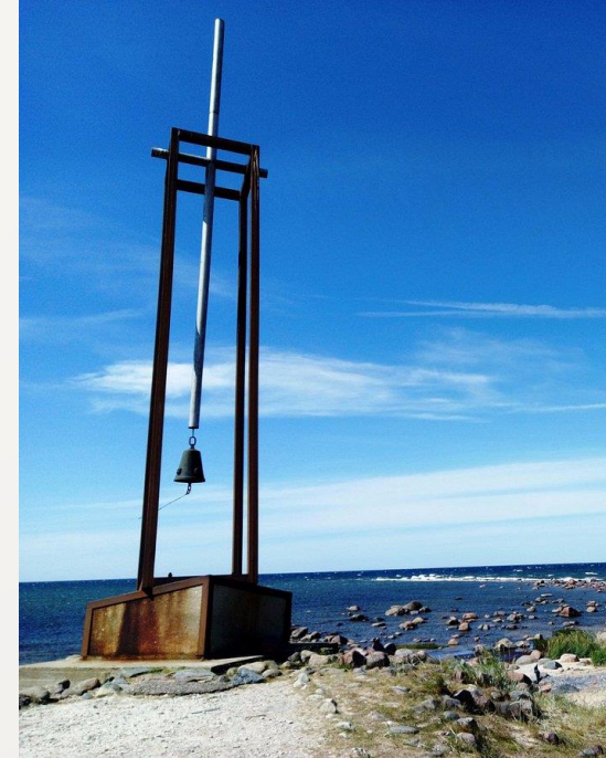
Memorial of the victims of ferry Estonia disaster, Hiiumaa, Estonia