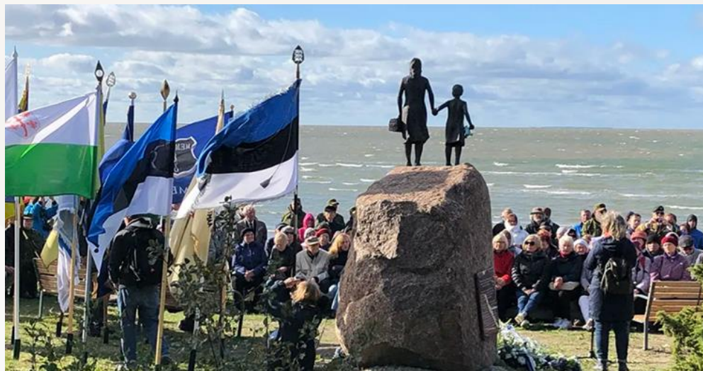
Boat refugee memorial on Puise beach, Lääne County, Estonia

Other natural or human- induced disaster or death related heritage