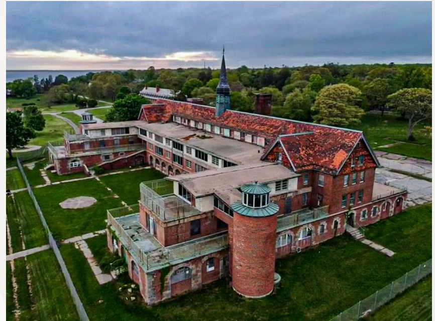
Waterford sanatorium, Massachusetts, USA