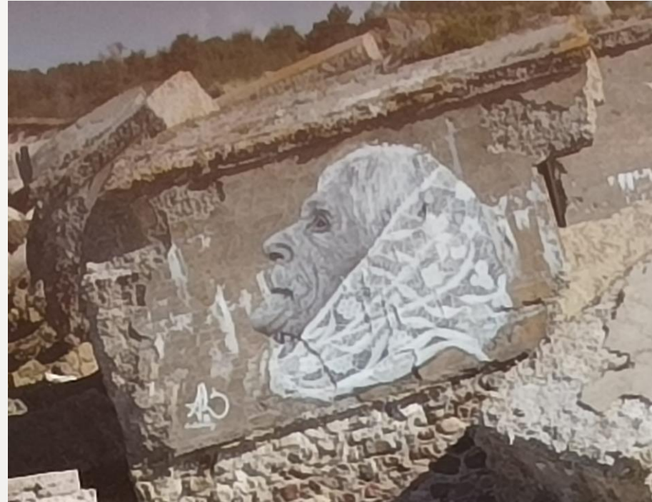
Contemporary street art, Liepāja Northern fort Source: Ilze Grinfelde, 2022